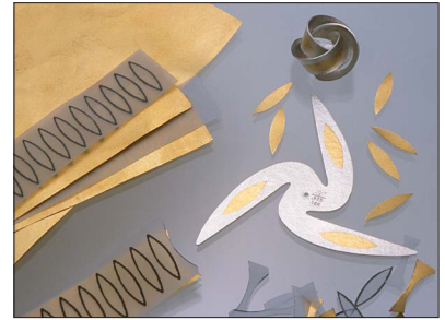
The Keum-boo Process