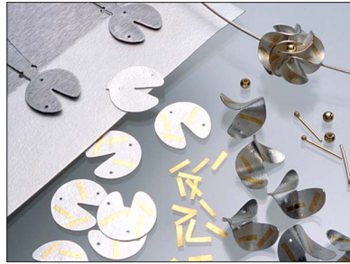
The Blanking Die Process