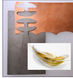
Making Multiples with Blanking Dies