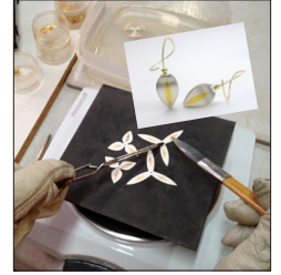
The Keum-boo Process