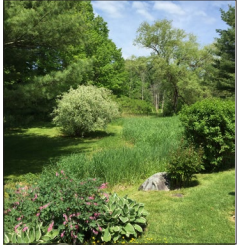
Riverview Workshops at Jayne Redman Studio

Jayne Redman Studio PO Box 126 Cumberland Maine 04021-0126 207.887.4131 www.jayneredmanjewelry.com