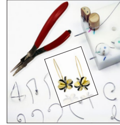
Tools and Jigs for Multiples