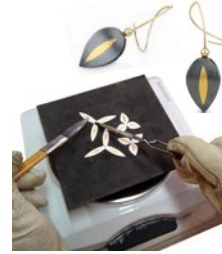
The Keum-boo Process