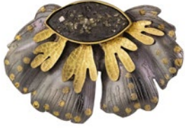
Imagery on Die Formed Silver

Jayne Redman Studio Falmouth, Maine 04105 207.887.4131 jayne@jayneredmanjewelry.com