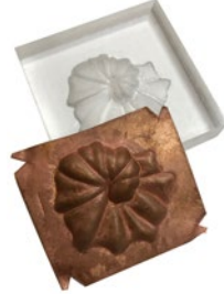
Die Forming Three Ways