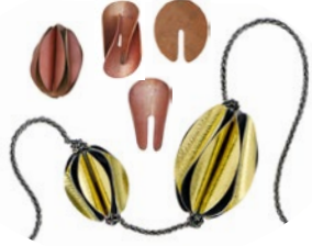
Form and Function: Engineering for Multiples