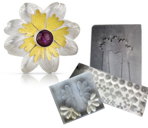
Imagery on Die Formed Silver

Jayne Redman Studio Falmouth, Maine 04105 207.210.6556 jayneredman@me.com