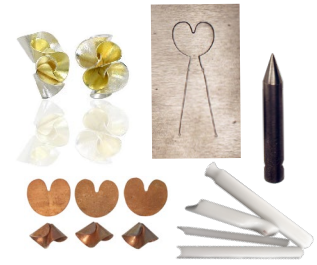
Forming for Multiples: Advanced Blanking Dies