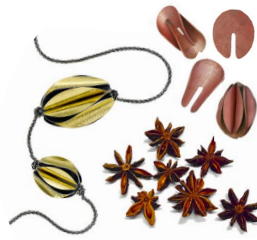
Engineering for Multiples