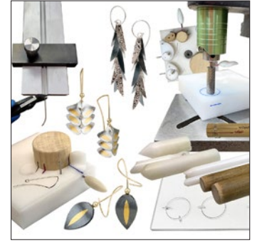
Tools and Jigs for Multiples